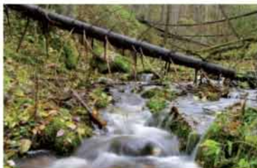
Primeval valley of Rõuge