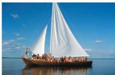
Lake Võrtsjärv trawling net boat