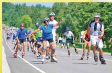
Tartu Roller Skate Marathon