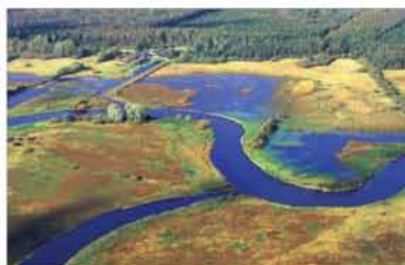
Alam-Pedja Nature Reserve