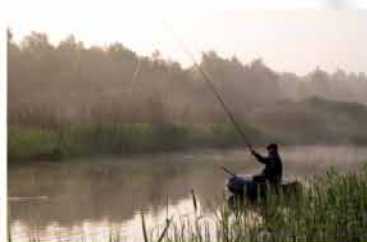
The fishing waters of South Estonia