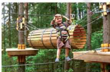
Otepää Adventure Park