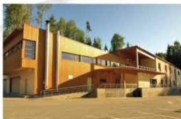
Holstre-Polli Recreation Center