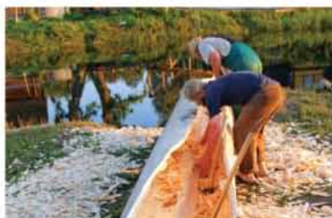
Soomaa National Park