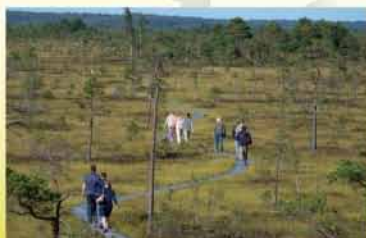
Ingatsi Hiking Trail