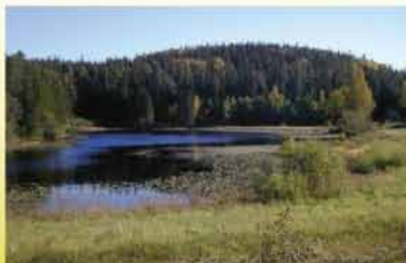
Vällamäe Nature Trail

Võrumäe Suur Munamägi Rõuge Haanja Nature Park