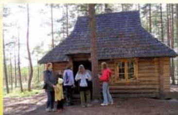
Luhasso Log House