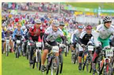
Tartu Bicycle Rally